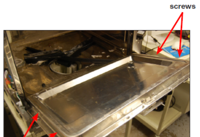
Figure 18c screws screws