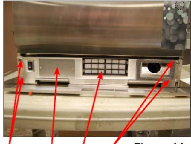
screws Figure 14a HEPA screws metal filter panel

NOTE: Be certain the gasket is properly positioned in the dryer inlet duct or replace with a new gasket.